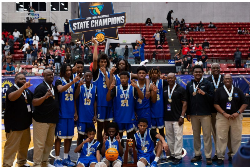
Gibbs High School boys' basketball team wins the class 4A state championship, it's first since 1969.