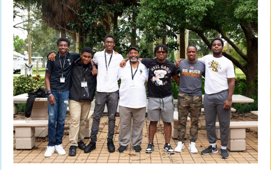
Men in the Making began in 2015 as a way to pair role models in the community with minority youth males.

DAP Acceptance Period February 12 - 21, 2025